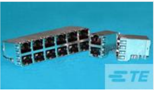
TE Part #6368062-8 2X4 OFFSET STK MJ,SHLD,W/LED