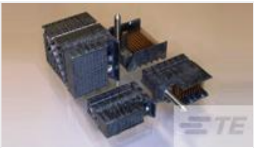
TE Part #2057433-3 IMP100S,H,V2P10C,UG,REW39,5.5